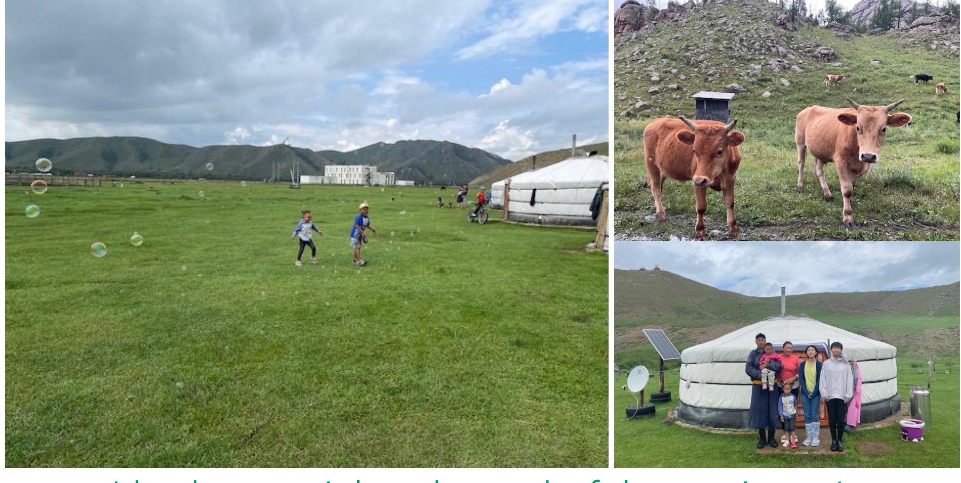
I had a special and wonderful experience!