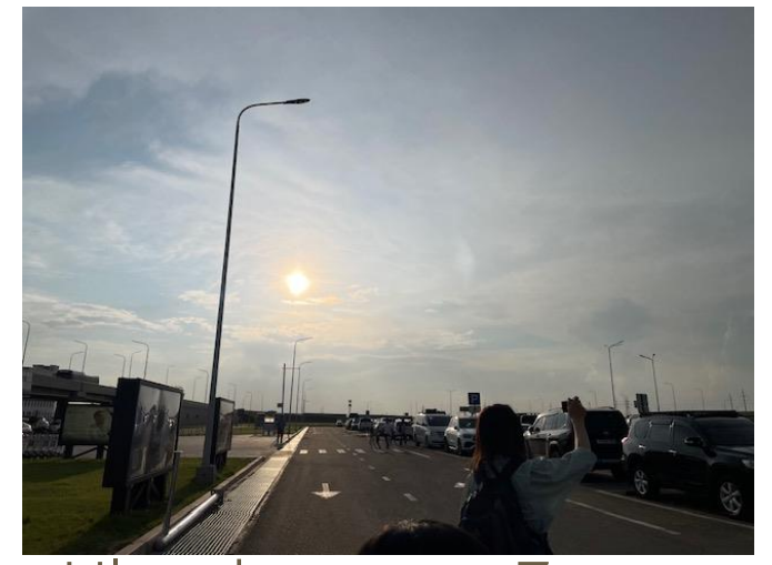
Ulaanbaatar at 7 p.m.